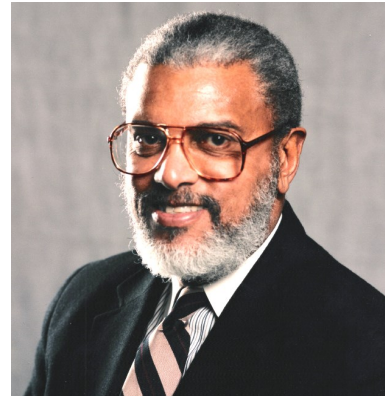
James C. Fletcher, Jr.